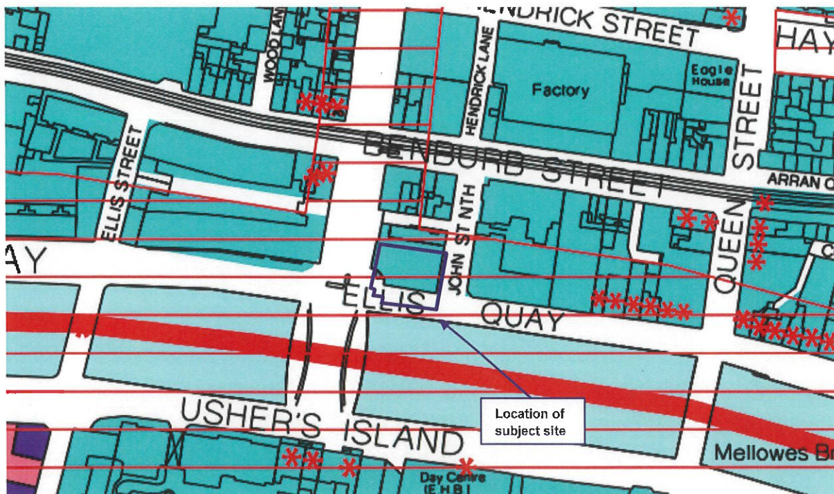
Figure 3.0 Extract from Zoning Map E in the Dublin City Development Plan 2016-2022 showing the site (outlined in yellow) zoned Z5 – 'City Centre'.

Under the Dublin City Development Plan 2016-2022, the application site is zoned 'Z5' (refer to map extract in Figure 5.0 below), the objective of which is 'To consolidate and facilitate the development of the central area, and to identify, reinforce, strengthen and protect its civic design character and dignity.'