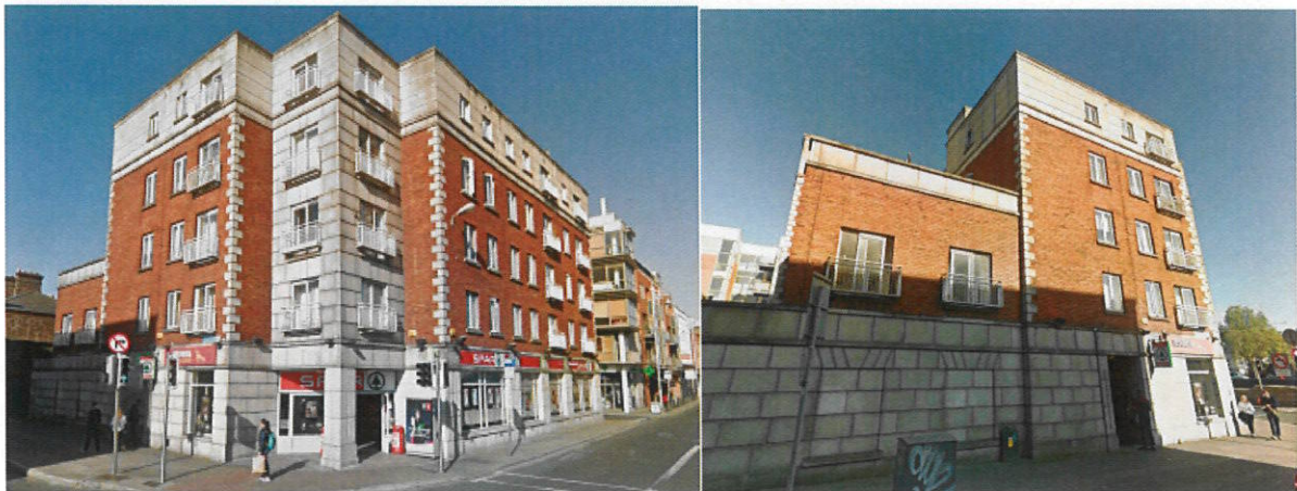
Figure 2.0 Image of the subject building at 'Chancery Hall' as viewed from Ellis Quay, Dublin 7.